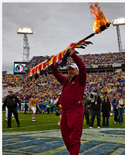
2010 – Coach Bobby Bowden throws spear for his last game.