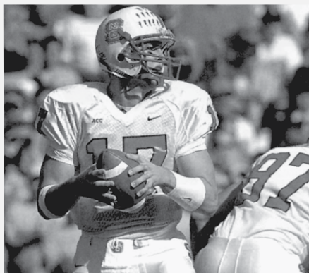
NC State quarterback Philip Rivers' outstanding play in 2003 earned him MVP honors as N.C. State beat Notre Dame.

BY THE NUMBERS • A RECAP OF TAXSLAYER GATOR BOWL HISTORY