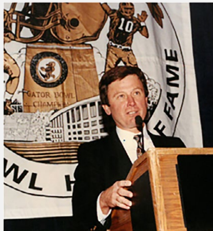
1992 – Steve Spurrier speaks at Gator Bowl Hall of Fame Lunch.