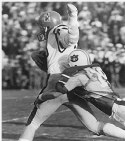
1971 – Archie Manning plays with broken arm.