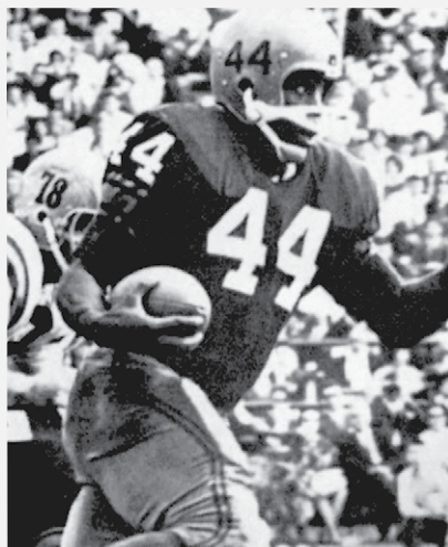
Floyd Little, Syracuse