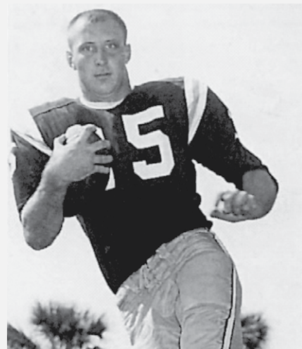
Fred Biletnikoff, Florida State