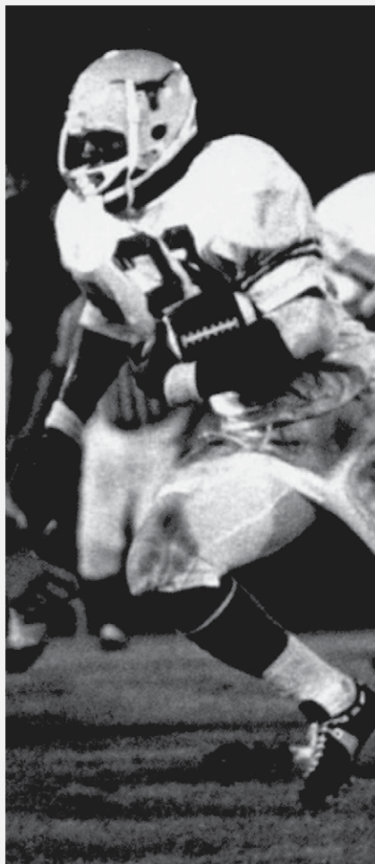
Earl Campbell, Texas