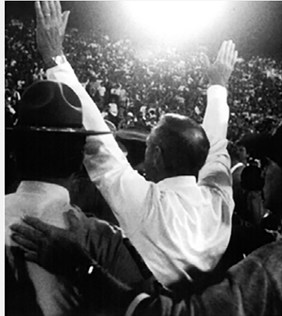
1989 – Vince Dooley waves to crowd after victory.

game has been televised nationally every year since.