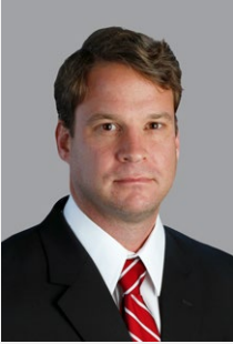
Head Coach Lane Kiffin

Lane Kiffin is in his fifth season at Ole Miss and has led the Rebels to five consecutive bowl berths, including two New Year's Six appearances, under his guidance since 2020.