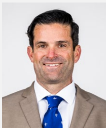
Head Coach Manny Diaz

Manny Diaz was named the 23rd head football coach at Duke University on December 7, 2023.