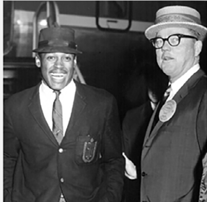
1966 – Floyd Little arrives at the Gator Bowl.

The status of the TaxSlayer Gator Bowl has evolved through the years. As noted above, the 1955 game was the first coast-to-coast telecast of a bowl game (Vanderbilt / Auburn) and the